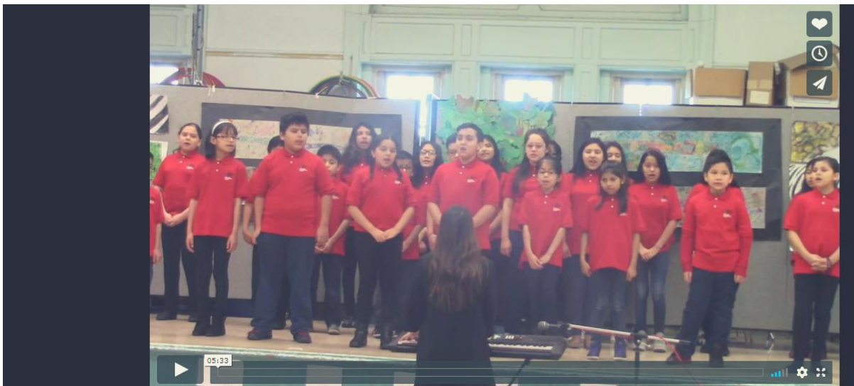
Whittier Chicago Children's Choir

External Partners obtained through New Chance funding: Chicago Children's Choir # of teachers trained: 1 Visual Arts Teacher